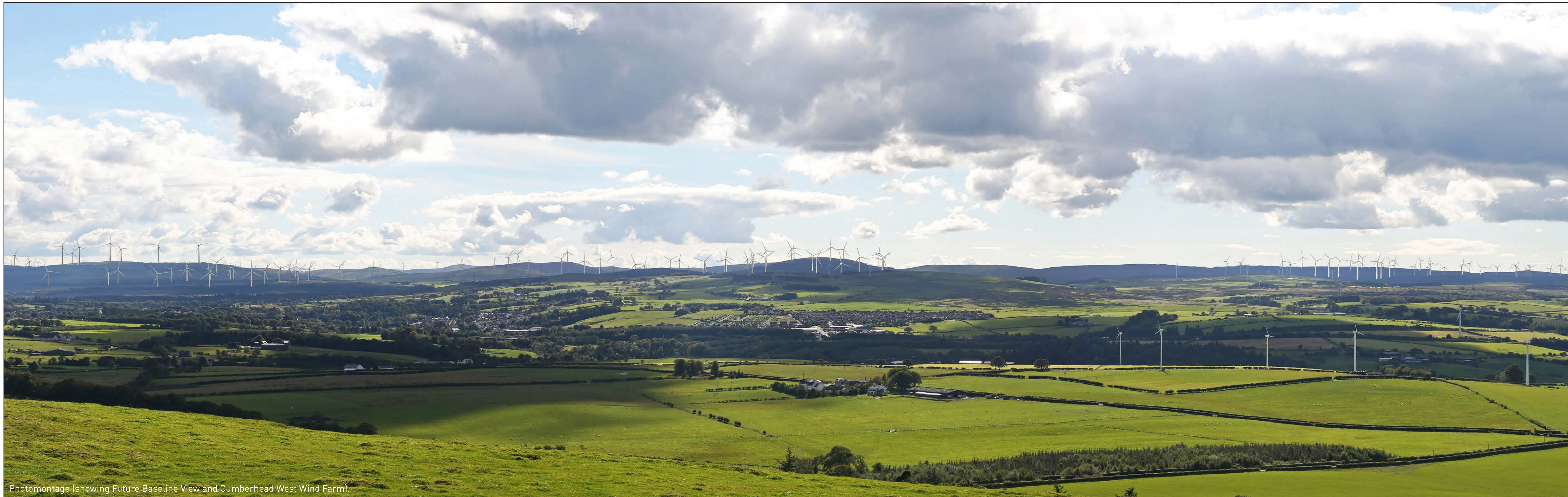
Photomontage (showing Future Baseline View and Cumberhead West Wind Farm).