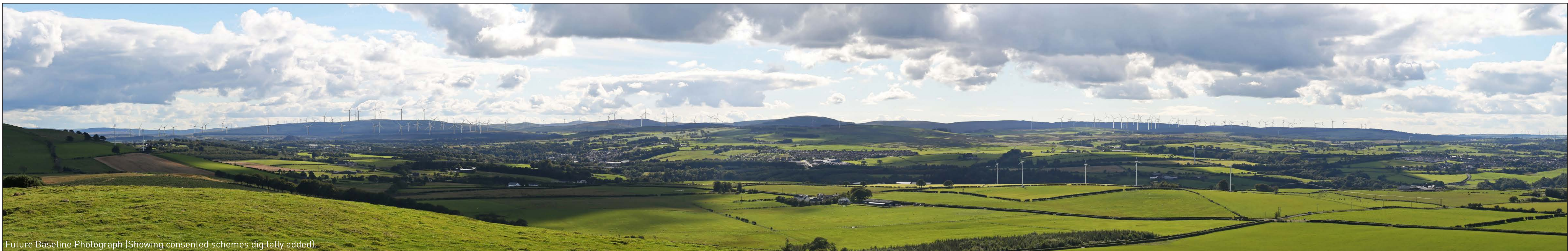
Future Baseline Photograph (Showing consented schemes digitally added).