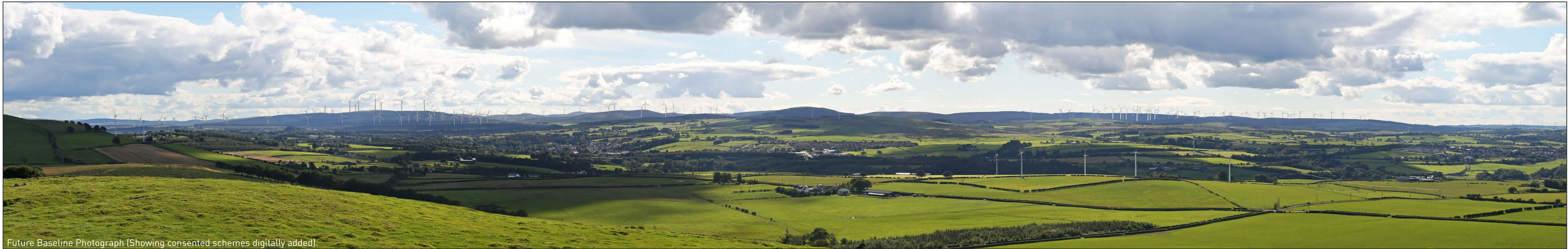
Future Baseline Photograph (Showing consented schemes digitally added).